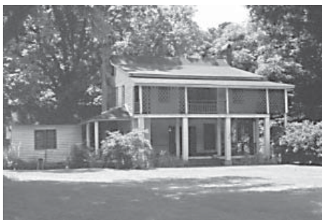
John Watkins House, 1820s

At the former Bermuda Grocery, note the Old Federal Road Granite Marker. The Old Federal Road is the entire eastern border of Monroe County. The Old Federal Road was built from Washington, D. C. to New