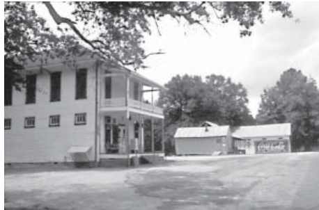
Lowrey Trust Store at Burnt Corn, 1890

At 14.3 miles from Courthouse Square, you will dead end at a T-shaped intersection. Turn right and proceed to Burnt Corn, via the Old Federal Road. At 14.8