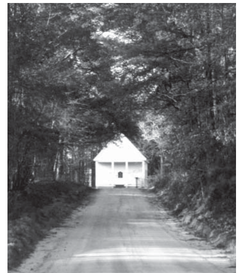
Old Scotland Presbyterian Church